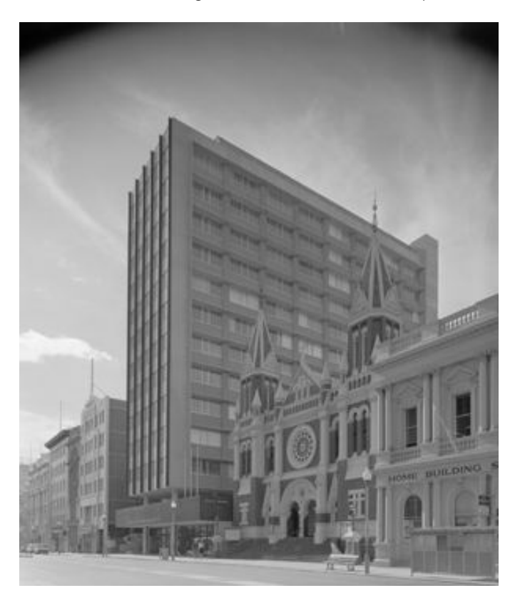
ANZ Bank Building 84 St Georges Terrace, Perth (SLWA 342623PD)