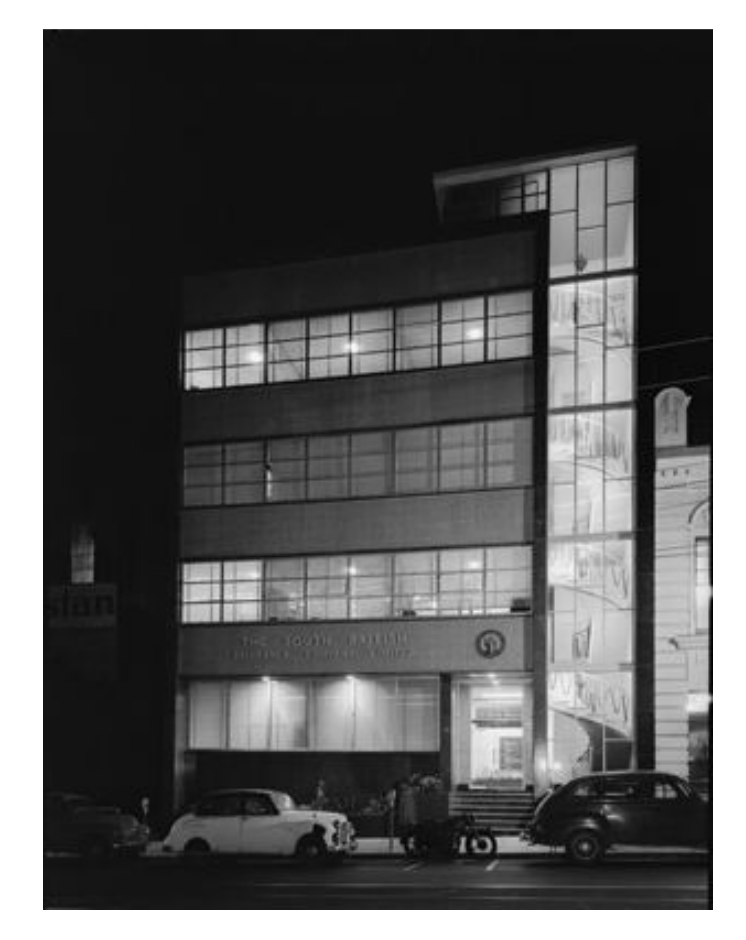
South British Insurance Building 23 Barrack Street, Perth (SLWA 239839PD)