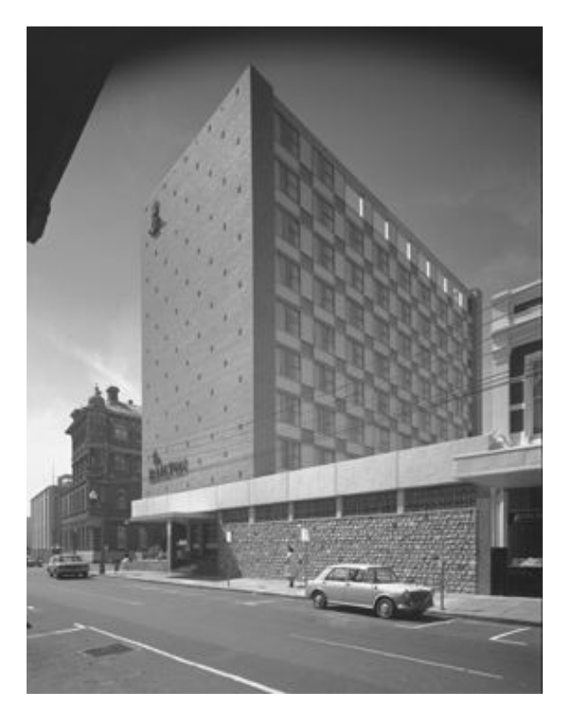
Railton Temperance Hotel on the south-east corner of Murray and Pier Streets – view looking across Pier Street 1965