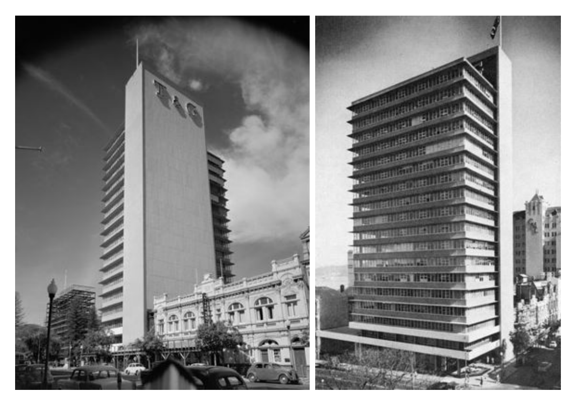
T & G Building of 1961 at 37 Barrack Street, Perth (SLWA 114950PD, 004143PD)