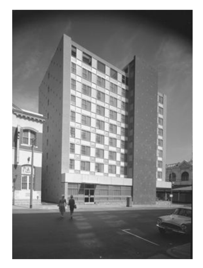
Railton Temperance Hotel on the south-east corner of Murray and Pier Streets – view looking across Murray Street 1965